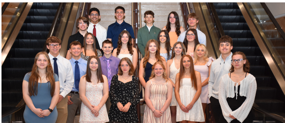
LEADERSHIP BLAIR COUNTY YOUTH - CLASS OF 2026