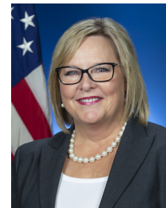
State Senator Judy Ward